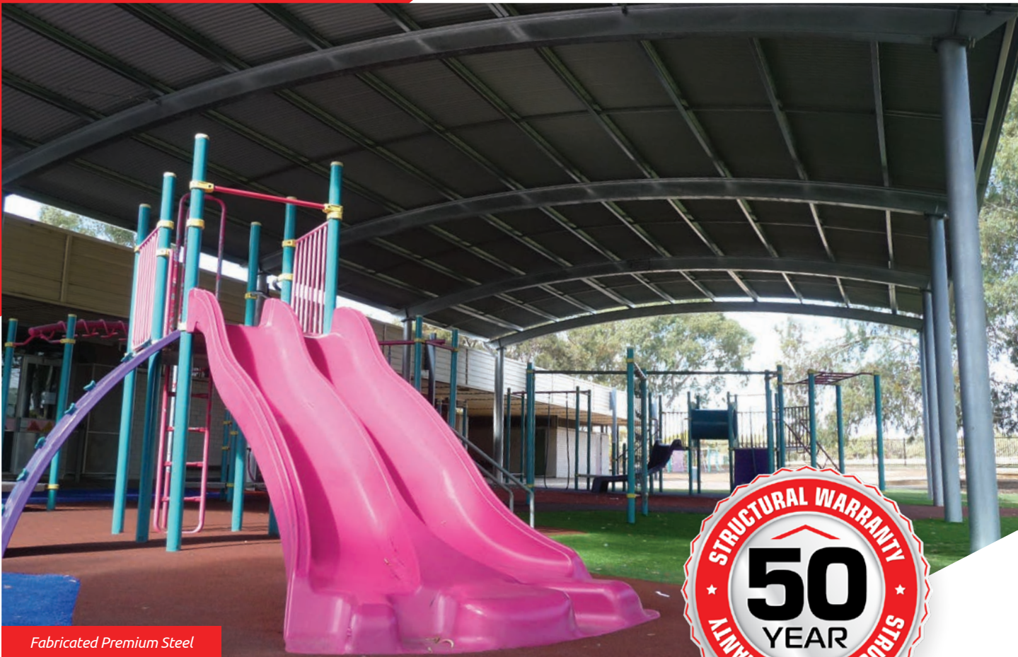
Fabricated Premium Steel