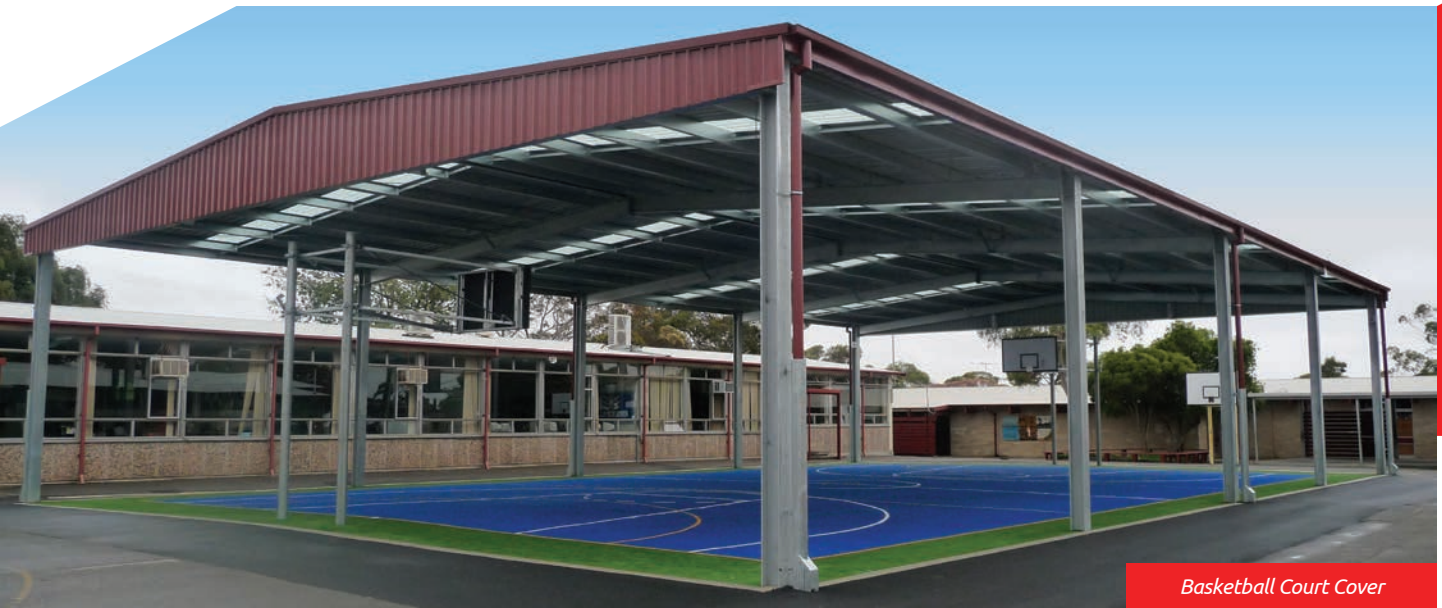
Basketball Court Cover