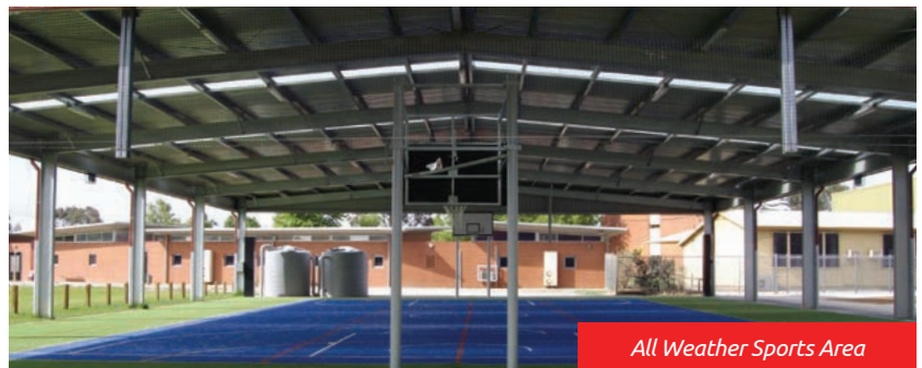
All Weather Sports Area