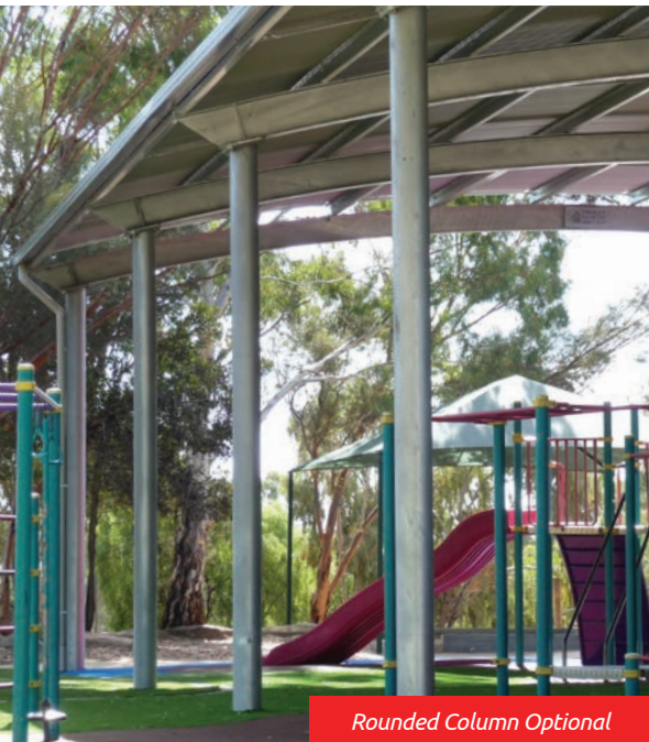
Rounded Column Optional