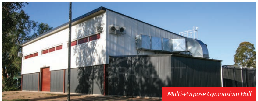
Multi-Purpose Gymnasium Hall