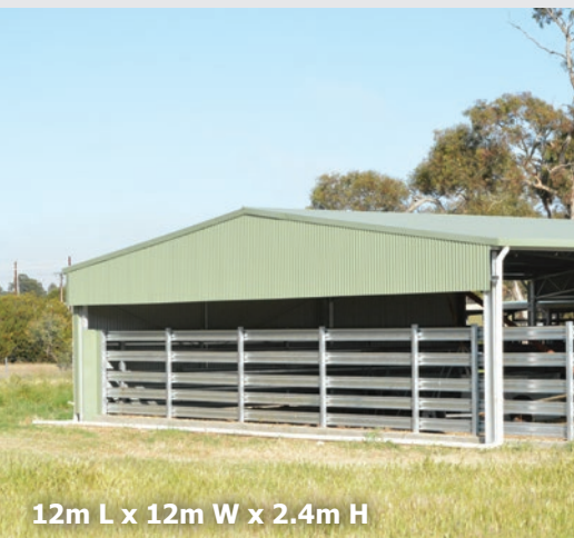
12m L x 12m W x 2.4m H