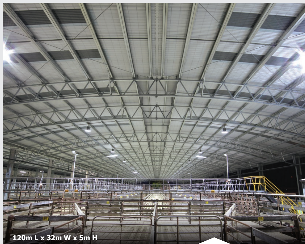
120m L x 32m W x 5m H