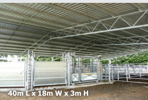
40m L x 18m W x 3m H