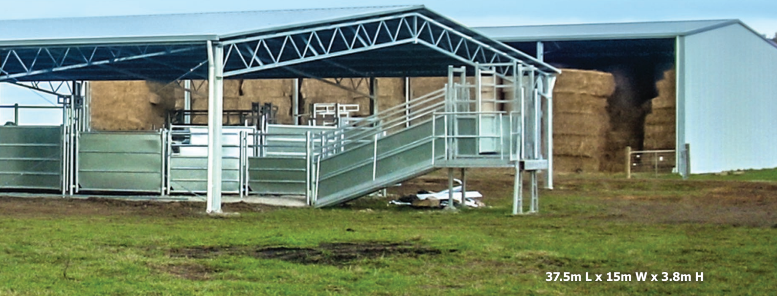
37.5m L x 15m W x 3.8m H